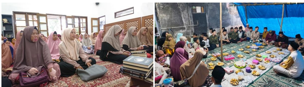
Figure 3. The presence of parents at religious study groups or religious activities

Example is the most dominant method in the process of internalizing the values of the Qur'an. Children learn not only from what they hear, but also from what they see. When parents consistently perform congregational prayers, read the Qur'an, and show good behavior, children will tend to imitate these behaviors. Therefore, role models have a very important position in Islamic education.