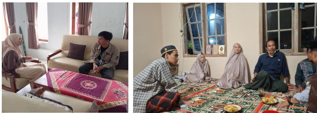
Figure 1. Interview process with family