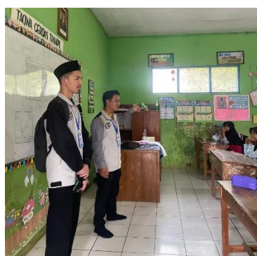
Figure 2. Check of children's participation in madrasah diniyah and TPA

The partner community actively participated in all stages of the program, including socialization, mentoring sessions, implementation of Qur'anic parenting practices, and program evaluation. Their involvement contributed significantly to the successful achievement of the program objectives.